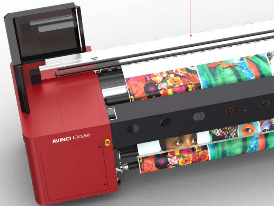
POWERFUL DRYING SYSTEM The dryer quickly dries inks and drastically limits set-off. Together with the vacuum table, it guarantees that thin transfer papers lie perfectly flat on the table and will not wrinkle.