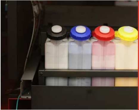
CLEAN AND ERGONOMIC INK SUPPLY SYSTEM Easily accessible 5-liter containers allow for long uninterrupted printing.