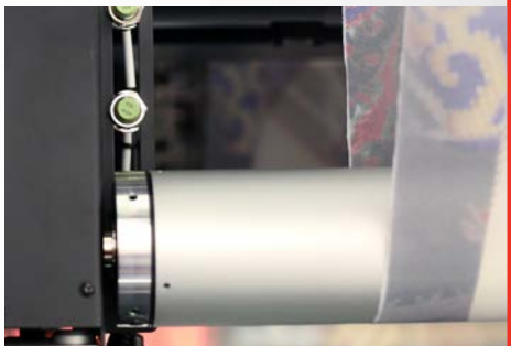
WRINKLE-FREE MEDIA TRANSPORT Carbon shafts, spreader rollers and a balancer roll guaranteeing stable tension make sure media transport is smooth and wrinkle-free at any speed.