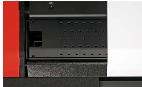
VACUUM ZONE Keeps thin transfer papers perfectly flat, ensuring accurate alignment and wrinkle-free printing.